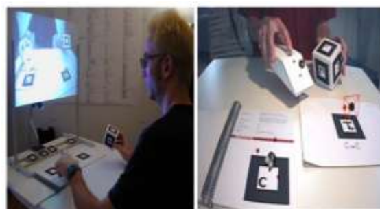
Figure 2: AR work bench

According to Augmented Chemistry: An Interactive Educational Workbench research work was done by Morten Fjeld and Benedikt M. Voegtli about tangible user interface called "Augmented Chemistry" which provides capability of working with single or multiple users at one time [13].