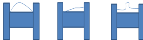
Fig.1 Ruffled bobbin

In the machine running condition the layering of wire when binding in the bobbin is not in linear condition, it gets irregular shape this is the cause of braking of wire or reduction in production, the ruffled bobbin shown in the following fig.