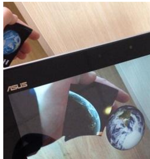
Figure 3 Developed application screenshot

When the application captures the markers with the camera virtual content will be displayed on the screen. 3D Model and video will be located as motion-sensitive to the marker. Within the time in which marker is seen by the application 3D Model and video will be generated on the motion-sensitive screen. An image of the developed application can be seen in Figure 3. If the card or camera angle is changed, 3D model and video can be formed again in a proper angle.