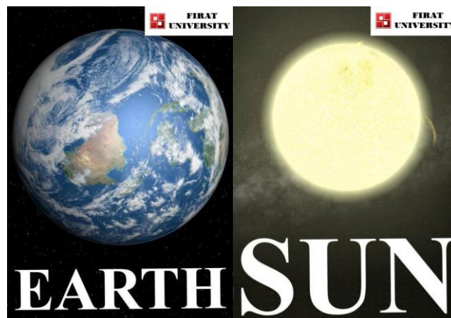
Figure 2 Used Markers

augmented reality application triggering visual learning on any subject. This application is based on adding a virtual content by augmented reality on cards which have been designed as a physical content. The marker cards given as examples are shown in figure 2.